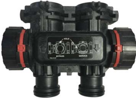
Img 11 - Connection Fitting

Your unit comes with connection fittings that allows the control head to connect to standard plumbing, including a bypass valve and stubs connection that — Img 11 . The included connection may or may not be installed on the control head, if it is, remove it for this step. To remove it, locate the red H clips holding it in place. Remove those and the connection will pull away from the control head. Note the direction of flow as indicated by the arrows, also note the direction of flow on the head itself, also indicated by arrows. The inlet side arrow will point toward the front of the head for incoming (untreated) water, the outlet side arrow will point away from the head for outgoing (treated) water.