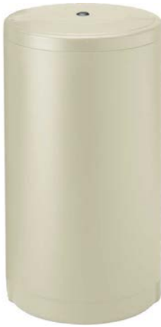
Img 7 - Brine Tank