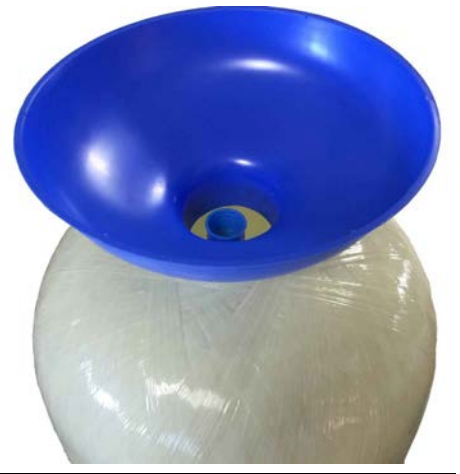
Img 2 - Tank with Funnel

Loading the media/resin and gravel is fairly easy. Some systems include a funnel to make loading the media/resin easier— Img 2 . If you do not have a large funnel to fit or the funnel that came with it is broken, the next best thing to use is your household blender pitcher. Take the bottom blade section off of your blender and the pitcher will screw directly into your tank making a great funnel.