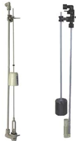
Img 8 - Two Most Common Float Assemblies

Remove the float assembly (you may need to remove a nut or two before removing the float) and remove any shipping bands that may be in place. The float will usually arrive preadjusted, but it is a good idea to check it. ** The float is NOT used to adjust the salt dosage. ** The float assembly is a safety mechanism designed to prevent over-filling in the event of a control head malfunction. It should be set to shut the water off before the water hits the overflow hole (the lowest hole on the outside of the tank). If it needs adjusted simply slide the grommets up or down until the float is properly positioned. If adjusting results in excess rod above the top of the brine well you may cut off the excess, but be sure to leave 1–2 inches (2.5–5 cm) of the rod above the grommet in case future adjustments are needed. Place the float back into the brine well and replace any nuts that secure it in place.