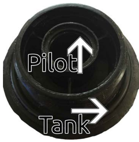
Img 3 - Control Head O-rings

Inspect the control head for any damage. Look for any damage to the threads (that screw into the tank), check all fittings to ensure they are whole and undamaged, and look for any other obvious signs of damage. Check to ensure the pilot and tank O-rings are present and free from nicks or kinks— Img 3 . It is also a good idea to verify that the riser tube fits snugly into the pilot hole and that the O-ring seals around it.