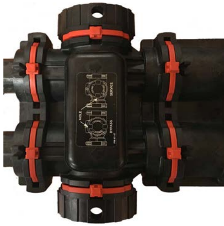
Img 12 - Bypass Position