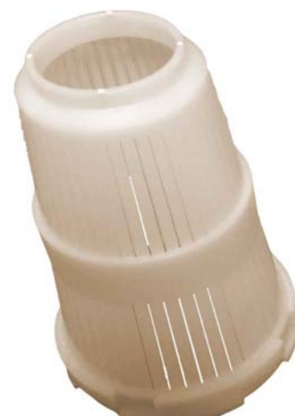
Img 4 - Top Distributor Basket

Depending on system configuration your system may include a top distributor basket— Img 4 . If you have more than one system you can match it up to the control head and riser to ensure it goes on the right system. In general, water softeners ship with an upper basket while other systems do not. If you did not receive one that is normal, they are not required and you can use the system without one. If you do have one the larger end will fit inside the bottom of your control valve, with the smaller end sliding over the riser tube pointing down into the tank. Most styles push into the control head and then turn clockwise to lock onto the control head, some just push in to the control head until snug.