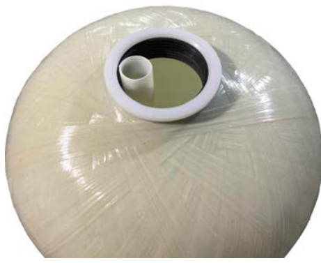
Img 1 - Tank & Riser

Look inside your resin tank and there will be a plastic tube inside— Img 1 . This is your riser (or distributor) tube that helps manage water flow through the system. Inspect the riser tube to make sure it is intact and without damage, removing it from the tank to ensure the distributor basket on the end is intact as well.. These are very durable and would rarely ever be damaged, but it is a good idea to check. *** Verify the riser tube fits and seals into the control head. *** A mismatched riser tube will prevent proper treatment, and it is much easier to correct the problem before the media is loaded. Place the riser tube back into the tank, there is a depression at the bottom of the tank in the center that it will sit in. With the riser tube properly positioned, ensure that it is no more than 1/4 inch (6 mm) above the top of the tank. If higher than 1/4 inch (6 mm) use a sharp knife, PVC cutter, or similar tool to cut it flush with the top of the tank. *** Do not cut the riser tube too short. *** If your riser tube is too short it will not seal inside the control head properly and your system will not work properly.