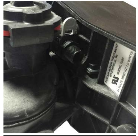
Img 10 - Brine Fitting

If you have the compression style, remove the large nut from the end of the elbow on the float assembly and slide it over one end of a 3/8 inch flexible line. If your float fitting has an insert (some do and some do not) push it into the end of the tubing AFTER sliding the nut on. Push the tubing into the float fitting and secure in place with the nut. Repeat the process on the other end of the brine line to connect it to the