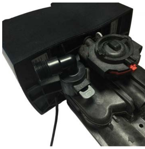
Img 5 - Drain Fitting

** Please note: ** Drain water comes out under line pressure, so it can be run vertically to connect to an overhead drain pipe.