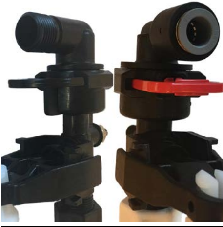
Img 9 - Float Assembly Fitting

If you have the compression style, remove the large nut from the end of the elbow on the float assembly and slide it over one end of a 3/8 inch flexible line. If your float fitting has an insert (some do and some do not) push it into the end of the tubing AFTER sliding the nut on. Push the tubing into the float fitting and secure in place with the nut. Repeat the process on the other end of the brine line to connect it to the